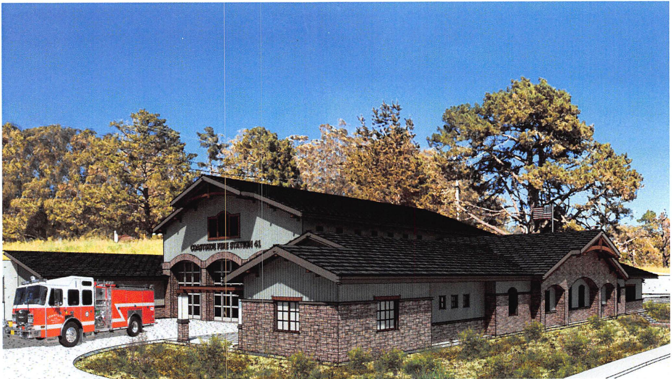
VIEW FROM OBISPO ROAD