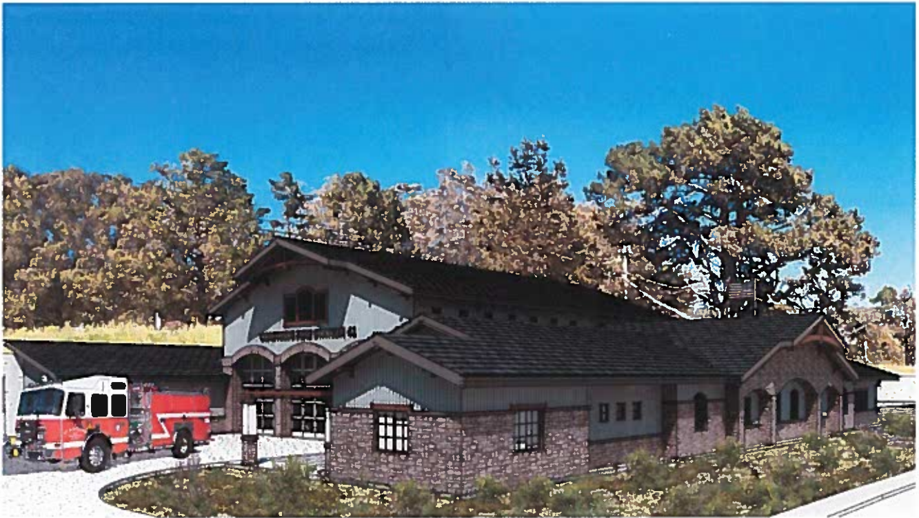
VIEW FROM OCEASPO ROAD